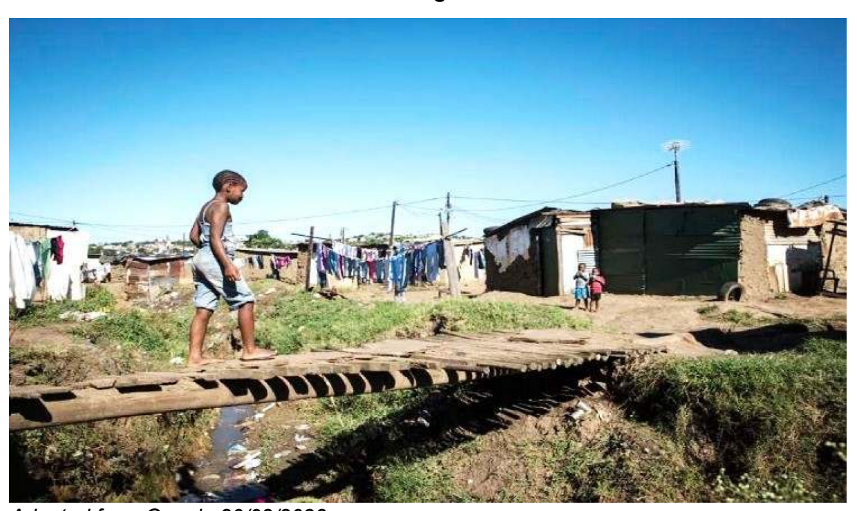
Adapted from Google 20/03/2023

Interview 5 people in your community about their knowledge on Service Delivery. Use the following guidelines to help your interview questions.